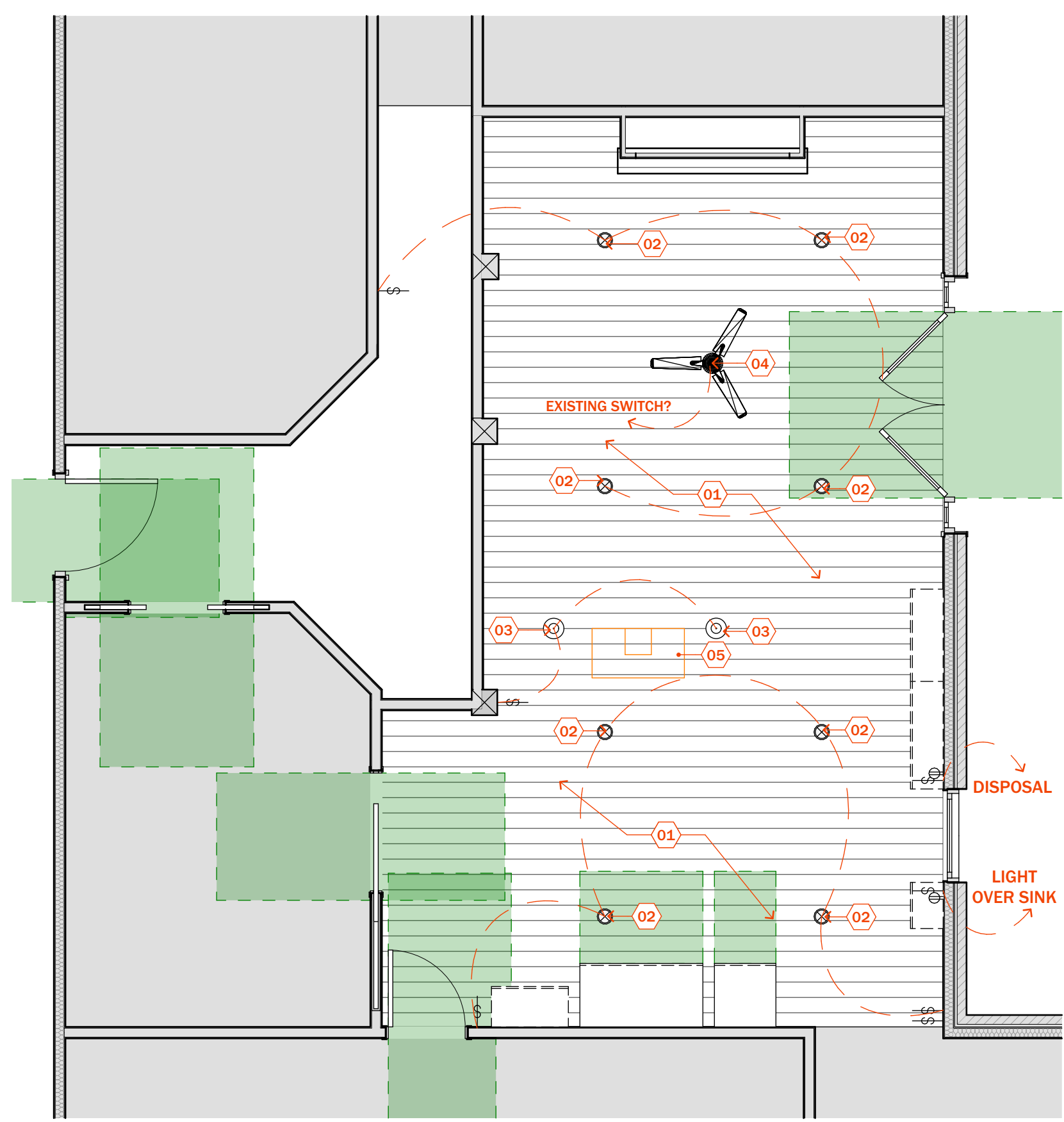
3 REFLECTED CEILING PLAN SCALE: 1/4" = 1'-0"