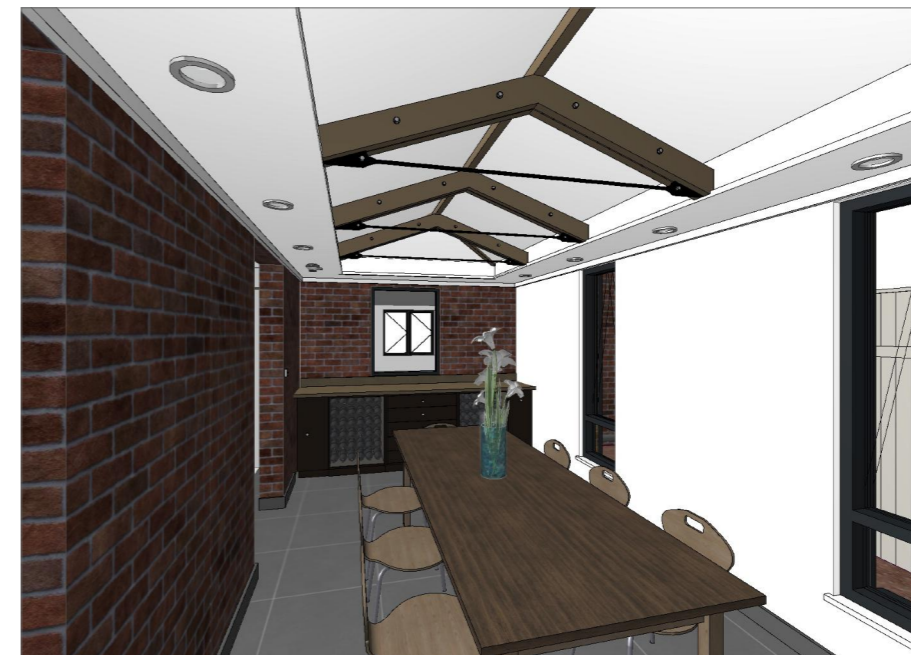
Internal View 2